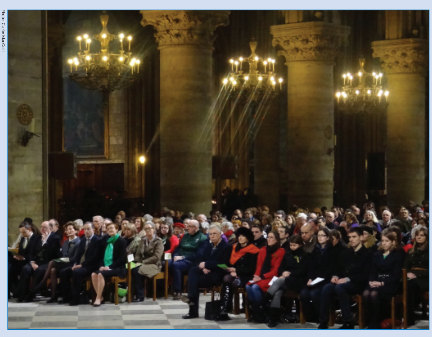
Led by the Irish Attorney General and Ambassador to France, more than 1,000 Irish pilgrims and friends fill the nave of the cathedral for the Irish Pilgrimage Mass.

Ireland's presidency of the European Union, but also the 850th anniversary of the cathedral.